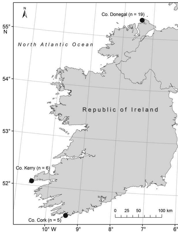
Fig. 2. Cetorhinus maximus . Locations for collection of mucus samples from basking sharks between 20 May and 14 July 2010

40 \mu l reaction mix contained 1 \times PCR buffer, 200 \mu M deoxynucleotide triphosphates dNTPs, 1.5 mM MgCl_2 , 0.3 \mu M of each primer, 0.5 U of Taq DNA polymerase (Bioline) and 10 ng genomic DNA. PCR products from 8 mucus samples and 1 Cetorhinus maximus tissue sample (control) were visualized on a 1% agarose gel, purified (QIAquick PCR purification kits, Qiagen ® ) and bidirectionally sequenced (Beckman Coulter Genomics). A sequence similarity search was performed in GenBank using the BLAST algorithm.